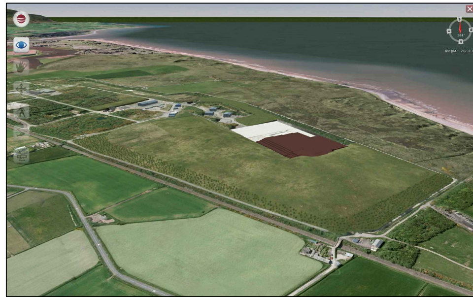
End of Phase 2