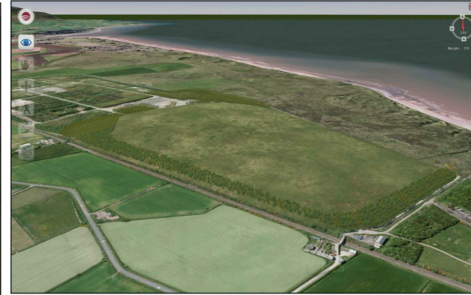
End of Phase 5/Restored Site